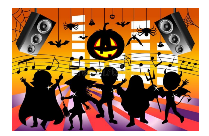
Spooktacular Fancy Dress Disco 9:30am—11:30am