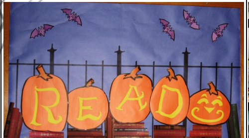
Spooky Tales & Treats: Halloween Storytime Adventure at East Ham Library